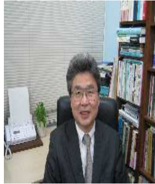
From the Chair